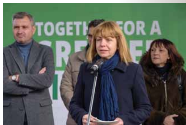
Bulgarian Mayor Sofia Jordanka Fandakova delivered a speech.