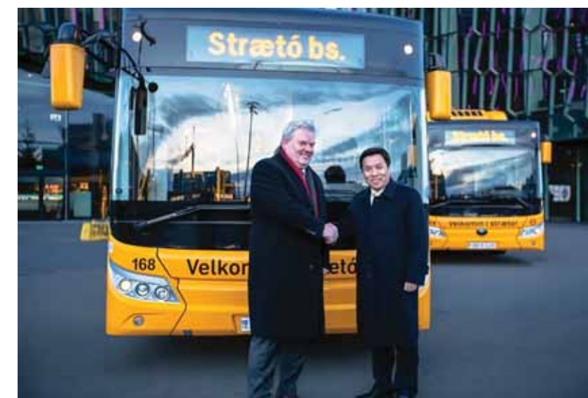
Icelandic Minister of Transport and Chinese Ambassador to Iceland took a picture in front of Yutong full electric city buses.

buses to the Icelandic market. As early as 2008, Yutong's first batch of diesel buses arrived in the country, replacing the antiquated diesel buses that were produced by local companies. After years of operation, the superior quality and performance of Yutong buses have been widely recognized by the Icelandic customers.