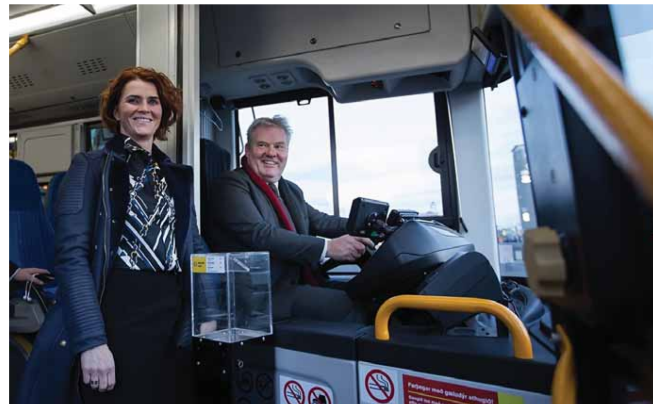
Icelandic Minister of Transport (R) and the Board Chairman of Icelandic Capital Public Transport Company (L) were on Yutong bus.

and praised Yutong's efforts in providing Iceland with new energy solutions.